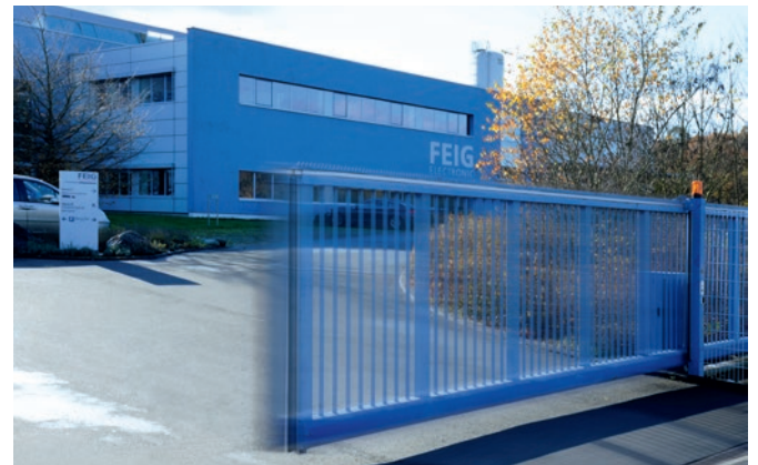
Perimeter Protection: Fast and safe access to industrial plants etc.

Suitable loop detectors and motion detectors are available from FEIG ELECTRONIC.