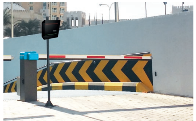
Parking Management: Comfortable access without waiting