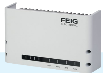
ISC.LRU1002 UHF LONG RANGE READER

UCODE DNA is considered the only identification technology to match the physical protection of a barrier with the cybersecurity necessary to truly protect entrances from unauthorized access. The long-range capability of UHF RFID also provides user convenience in terms of speed. Vehicles do not have to come to a complete stop. The authentication takes place in milliseconds as the vehicle approaches and the barrier quickly opens to allow passage. Drivers are not required to stop and open a window to present a credential to a card reader. The data capture is immediate, reliable, and transparent.